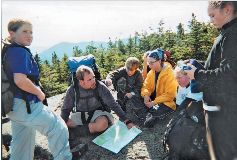
As students grow older, they take on more complex outdoor challenges.

biodiesel for school vehicles, initiating anti-idling campaigns, creating schoolyard wildlife habitats. The Ladder of Responsibility is an idea just waiting to happen. Be the first school in your community to create one and then let us know how it's working. ✍️